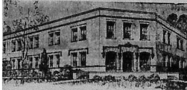
PROPOSED WOMEN'S DORMITORY